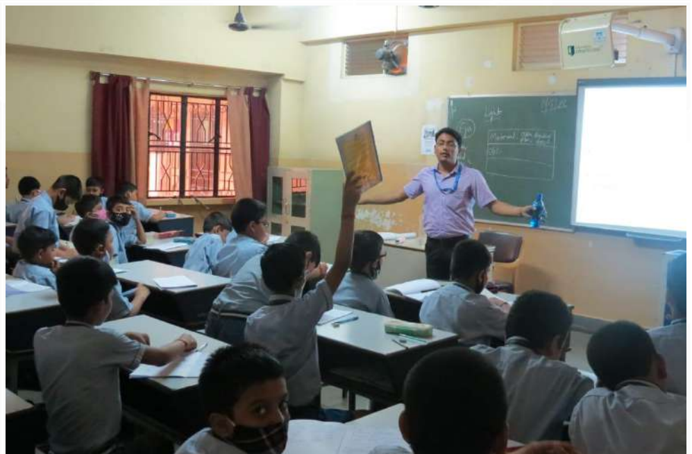
School Internship Programme