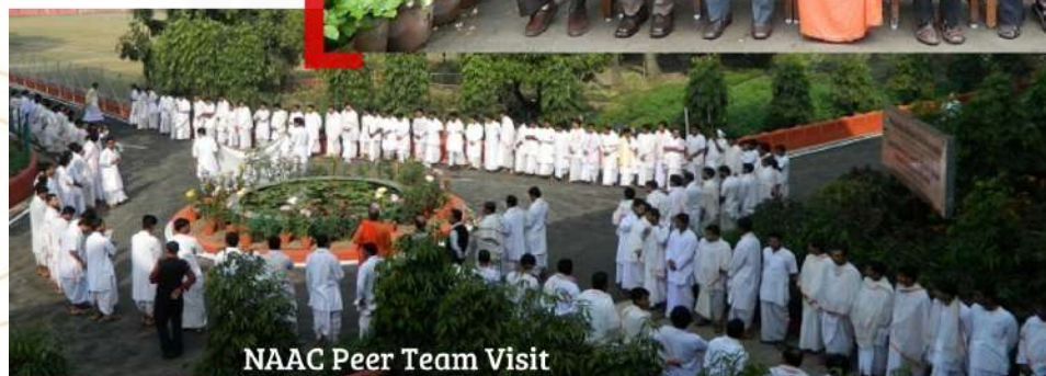
NAAC Peer Team Visit