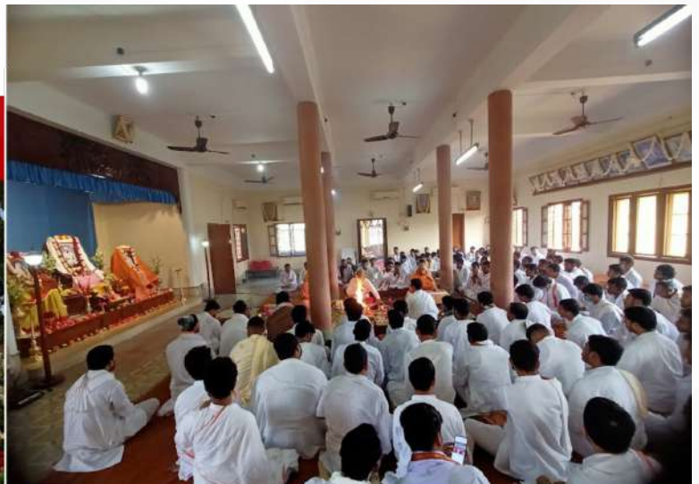
Hostel Prayer Hall