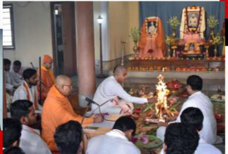
Vidhyarthi Brata Homa