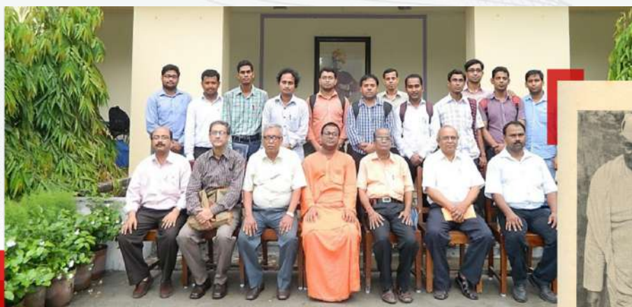
First M.Phil Batch