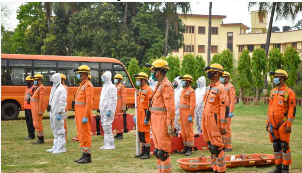
NDRF Disaster Management Drill