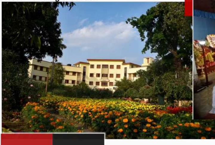
Hostel Building & Garden