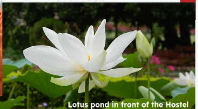
Lotus pond in front of the Hostel