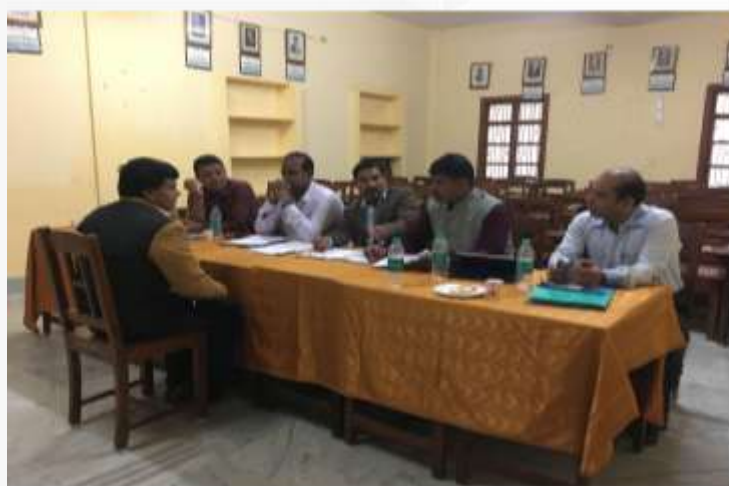
Campus Placement Drive