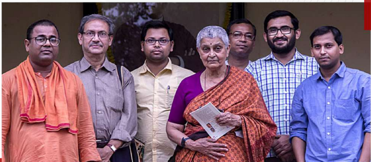
Gayatri Chakravorty Spivak with the Faculties

Sikshanamandira boasts a rich pool of eminent faculties of every discipline. Our faculties play an active role in conducting multifaceted researches in the field of Educational Studies both independently and under the umbrella of SWAMI VIVEKANANDA CENTRE FOR MULTIDISCIPLINARY RESEARCH IN EDUCATIONAL STUDIES - the apex research wing of Sikshanamandira. The availability of such collective teaching and research experience, makes sure that the transfer of knowledge to the students becomes fruitful and ineffaceable.